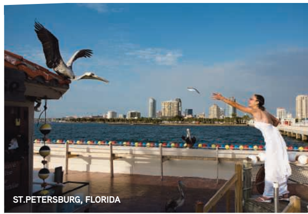
ST. PETERSBURG, FLORIDA